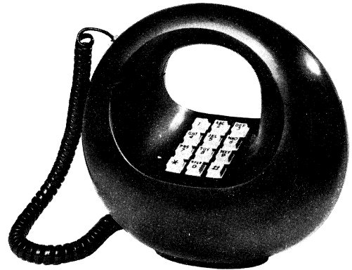
Fig. 1—2902A1 Telephone Set

2.03 These telephone sets are intended to be used as single line or two-party desk sets and are not recommended for use on four- and eight-party service.