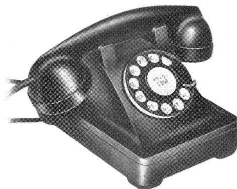
FIG. 1—309 TYPE