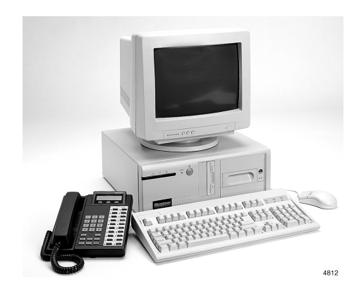
Figure 2 Stratagy 24 Plus

The Stratagy 24 Plus (Figure 2) can be upgraded to a Stratagy ES using a Stratagy 24 Plus to Stratagy ES Upgrade Kit (SES-SG24+UP-WKS or SES-SG24+UP-SVR). See the Stratagy R3 General Description for a general description and specifications for the Stratagy 24 Plus.