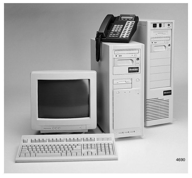
Figure 1 Stratagy Enterprise Servers

The Stratagy 24 Plus equipped with Release 3.1 software can also be upgraded to a Stratagy ES. All models use the same software, perform identical functions, and are factory loaded with either Microsoft Windows NT Server or Workstation.