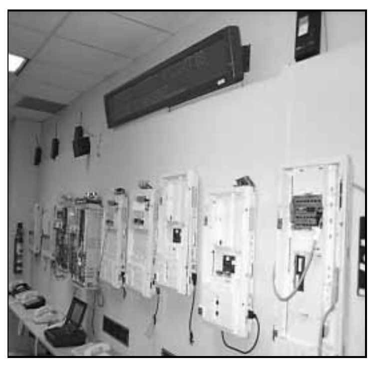
The Tech Support Lab Wall of Fame