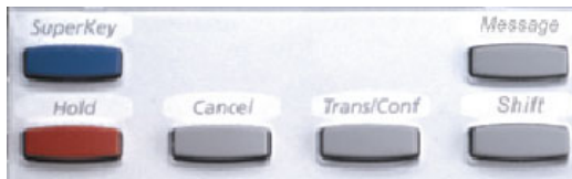
Figure 2, Fixed Function Keys on your 5010 IP Phone

The seven fixed-function keys are: SuperKey , Trans/Conf , Shift , Message , Hold , Cancel , and Intercom ; these keys, and the ▲ and ▼ keys, are described in detail under Fixed Function Keys .