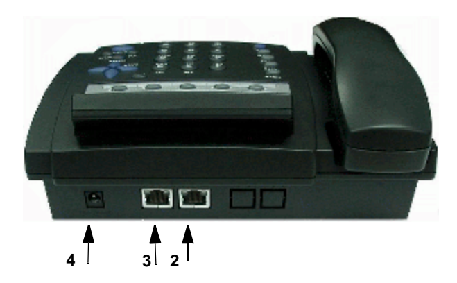
Figure 2. Alti-IP 600, Top View